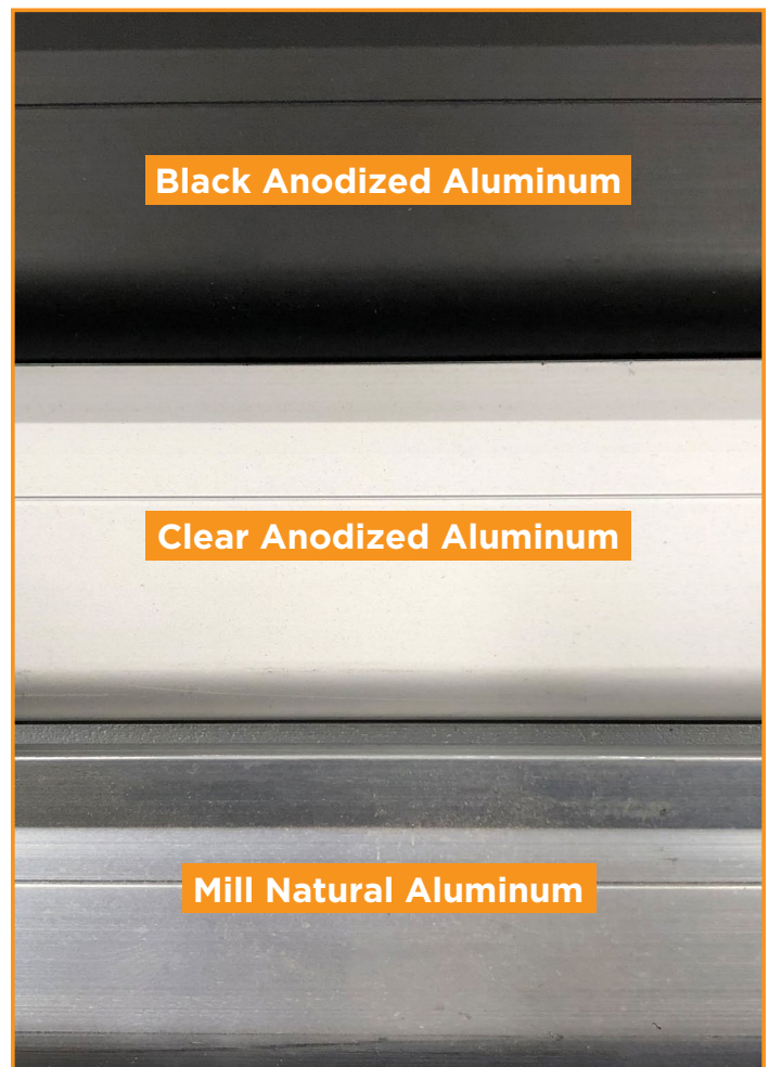
Examples of different surfaces in rails used for solar module mounting.